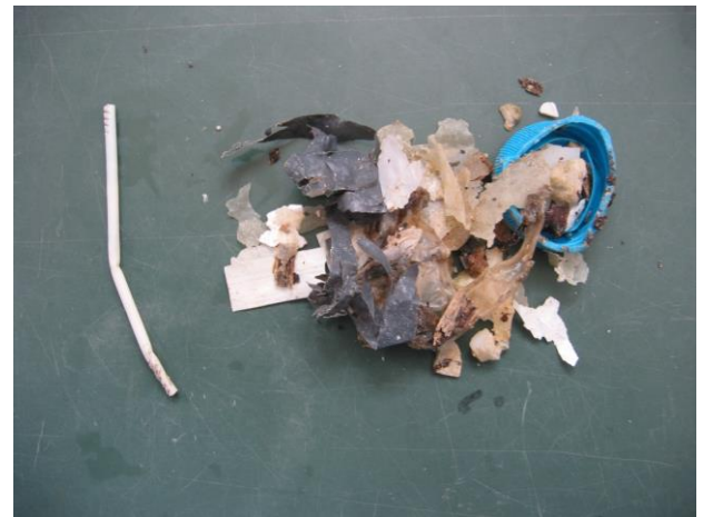
Presence of marine litter in the marine turtles faecis