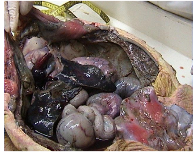
Dead turtles examined through necropsy